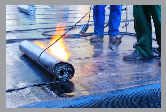
One of the common applications for these filters is to address odors created during nearby tarred roofing replacement or repairs. Carbon pleats offer a good solution to a temporary problem.

The Camfil CityPleat is a combination particulate and molecular air filter suitable for a wide range of HVAC systems capable of holding a two or four-inch deep filter and where removing particulate matter and controlling odors, and gaseous contaminants in a single air filter is desired.